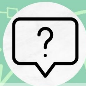
STUDENT AWARDS & SCHOLARSHIPS